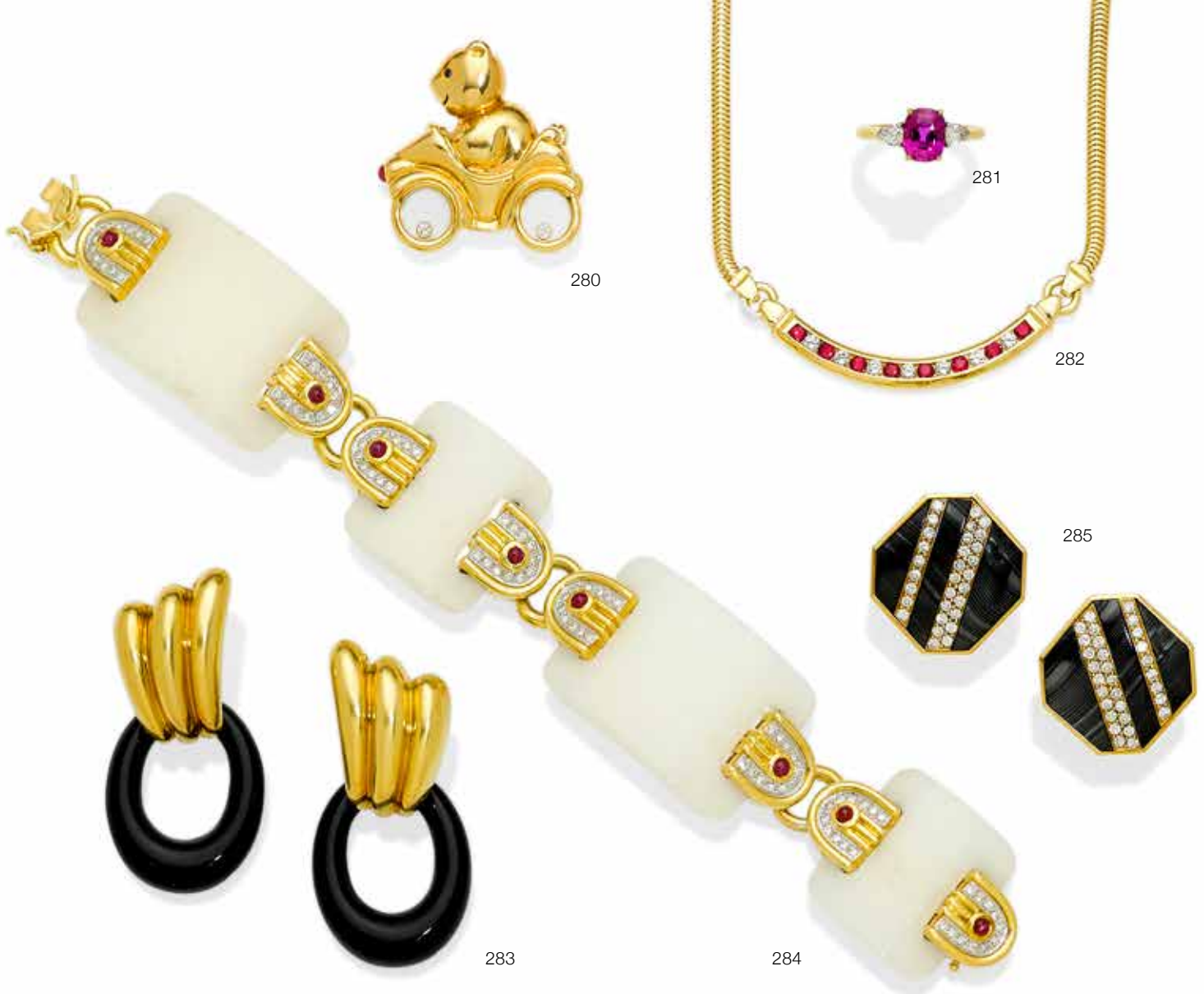
280 AN 18K GOLD AND GEM-SET 'HAPPY DIAMONDS' TEDDY BEAR BROOCH, CHOPARD signed Chopard no. 90/2121-20 9625017; length: 1 1/8in.