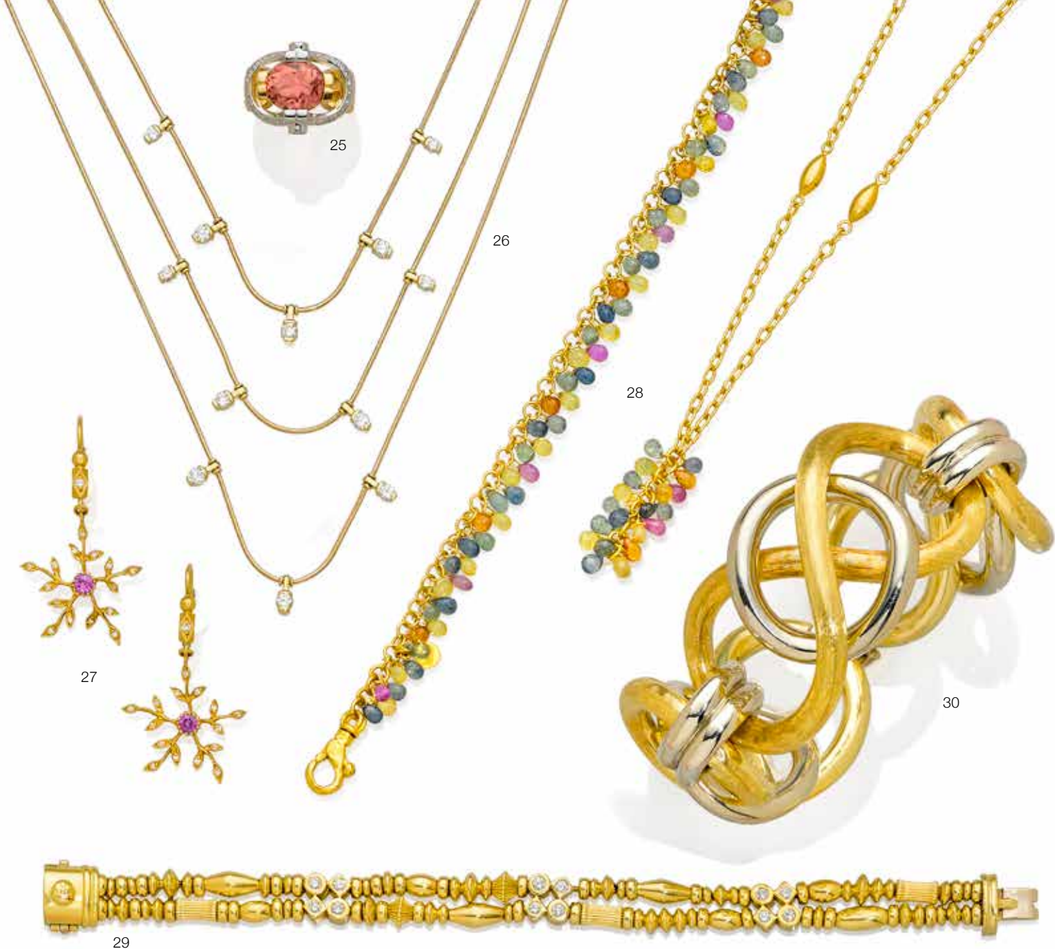
25 A TOURMALINE, DIAMOND AND 18K BI-COLOR GOLD RING

oval-shaped pink tourmaline weighing: 3.53cts; size: 6 1/2